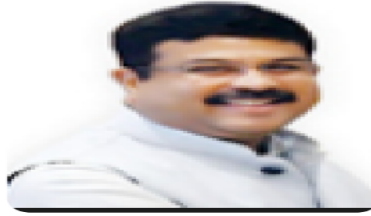
Hon. Mr. Dharmendra Pradhan